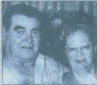
The Kunkles recently